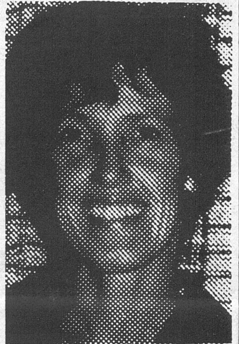
(Dr. Joanna Macy, Ph.D., is a Buddhist scholar and meditation teacher active in movements for social change in developing countries and the industrialized West. She is the author of Despair and Personal Power in the Nuclear Age (New Society Pub. 1983) and Dharma and Development (Kumarian Press, 1983). Dr. Macy and her husband were visiting teachers this winter at Pendle Hill, the Quaker study center in Pennsylvania.)

Your lives are woven inextricably in the jeweled net of Indra, as interwoven as neurons in the mind of a great being. You cannot fall out of that web. No stupidity, cowardice or failure can ever separate you from that living net, because that is what you are. Rest in that knowing, come home to it. In that is the Great Peace. Out of that you can risk everything, knowing that each encounter can be a coming home again to that Great Peace. Indeed, it is so. □