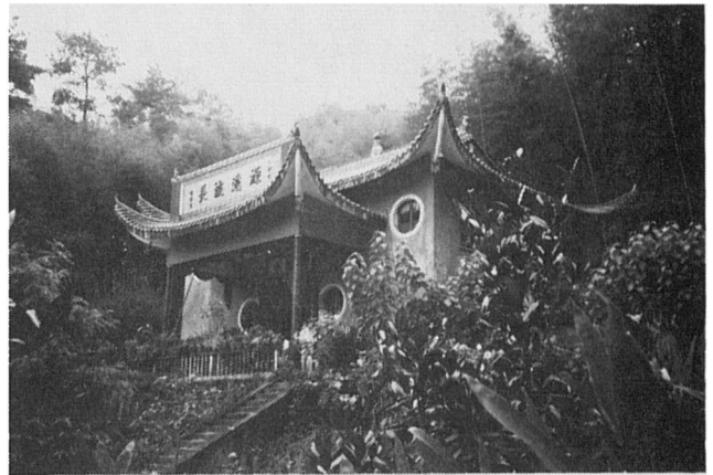
Empty Cloud Zen Master's memorial at Un Mun's temple in China.

conference is to help all people become one. Everybody understands that in our world there is a lot of suffering. All people become one means, everyone find their true self and help this world. Then this conference is not just a ceremony, but has real meaning for the life of this world. So I want to thank you all for coming here to Zen's primary point and I hope that we all practice hard and continue to attain our true self moment to moment.