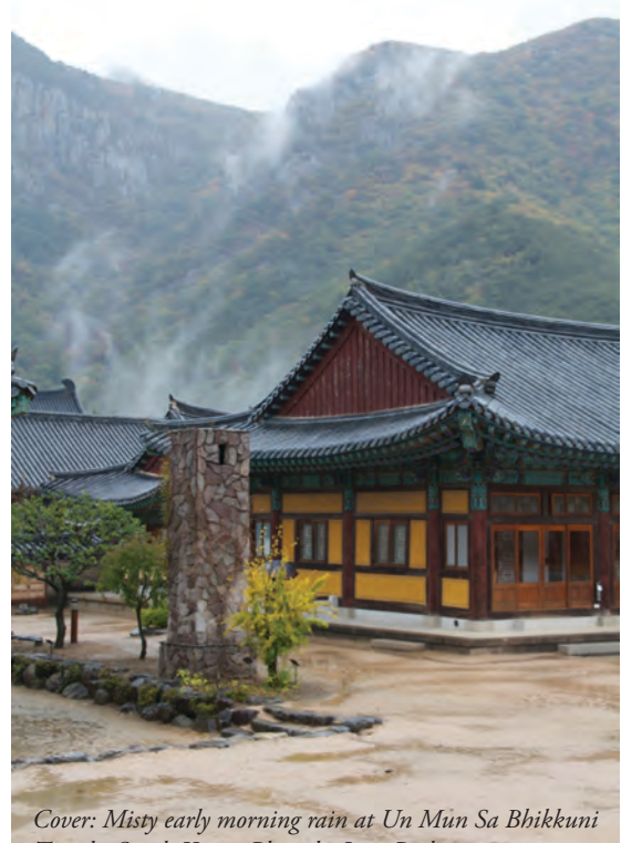
Cover: Misty early morning rain at Un Mun Sa Bhikkuni Temple, South Korea.

Membership in the Kwan Um School of Zen-America ......31