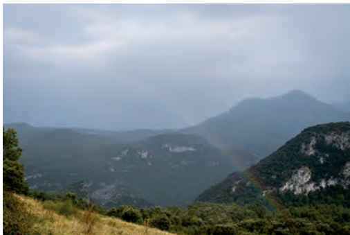
Text by Gasper Sopi.

"Spring comes, grass grows by itself. The blue mountain doesn't move. White clouds float back and forth."