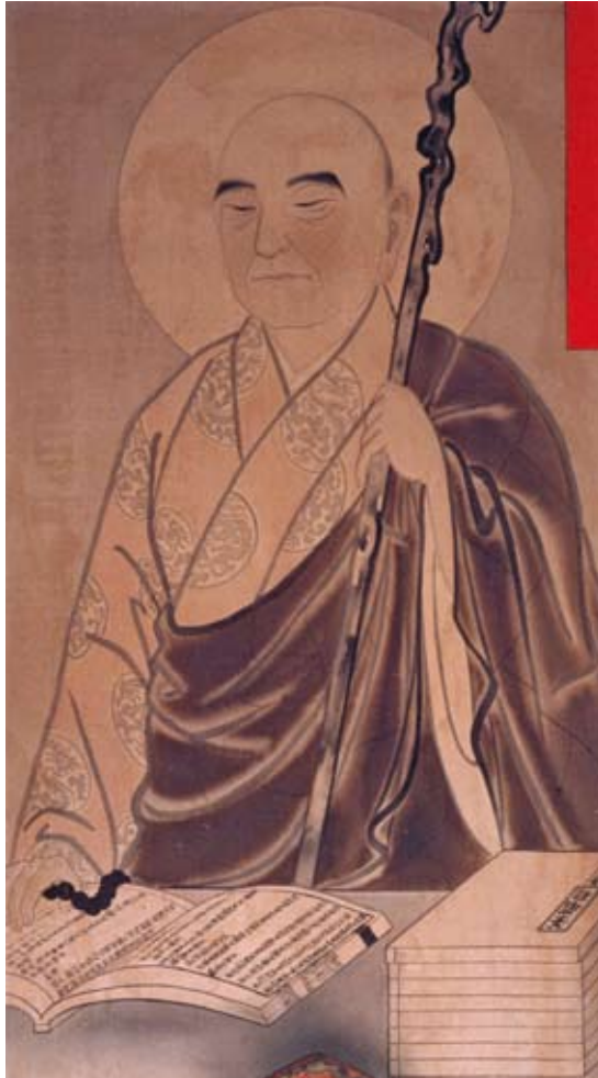
Portrait of Master Wonhyo. Property of Bunhwangsa