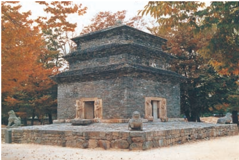
The Stone Stupa at Bunhwangsa, the temple where Wonhyo did the bulk of his writing