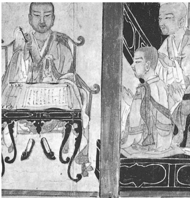
Master Wonhyo, lecturing on the Vajrasamādhi-sūtra