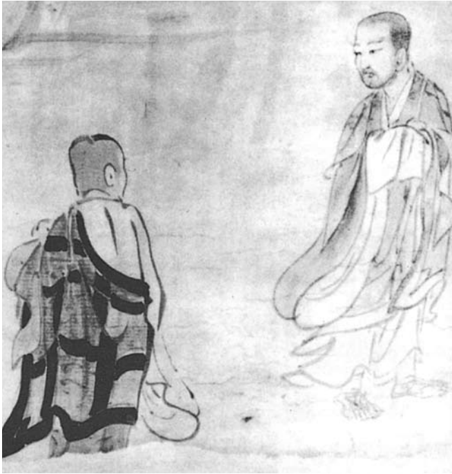
“Hwaom Yeongi”: Wonhyo depicted parting from Uisang after attaining enlightenment on his intended trip to the Tang