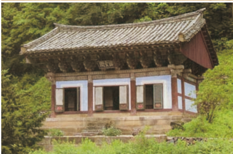
Above: Scene of Pyohun Monastery, Mt. Geumgang.