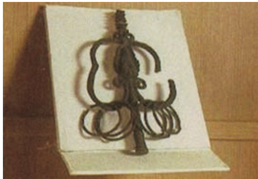
Above: Cheongheojip .