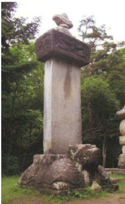
Left: Stupa of Great Master Seosan (at Daeheung Monastery). Right: Funerary stele for Great Master Seosan (at the site of Baekhwa Hermitage in Pyohun Monastery, Mt. Geumgang).