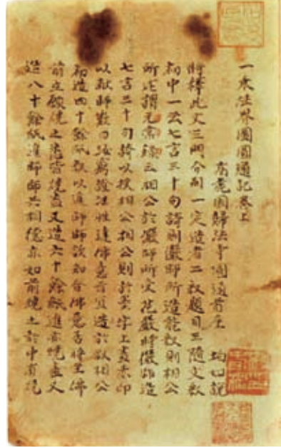
Left: The funerary pagoda ( pudo 浮屠) of Sólcham, Kim Sisüp. Right: Handwritten manuscript of the Ilšung pōpkye to wōnt'ong ki (in the possession of Dongguk University).