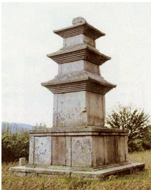
Stone pagoda at the site of Hwangbok Monastery, in Kuhwangdong, Kyōngju city, North Kyōngsang Province. National Treasure no. 37.