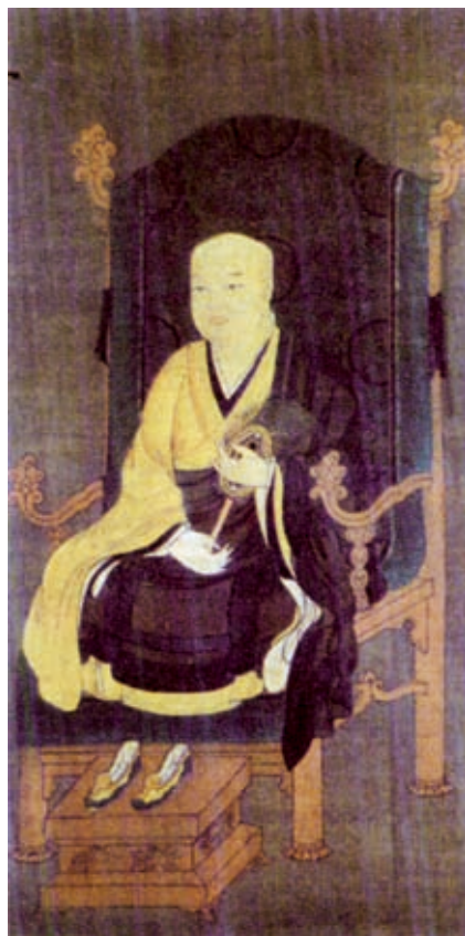
Portrait of Dharma Master Üisang (in the possession of Kōzanji 高山寺 in Japan).