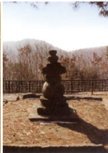
Above-left: Jagyeongmun , by Yaun, Kansong Art Museum Above-right: Woodblock of Jagyeongmun , Haeinsa Below-left: Hyeonjeongnon , by Gihwa, Kansong Art Museum Below-right: Stupa of Gihwa, Jeongsusa, Incheon