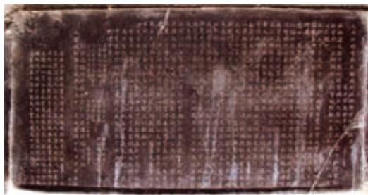
Above: Stupa of Woncheuk, Xingjiaosi, Xian, Shansi, China Below: Inscription of Woncheuk, Xingjiaosi, Xian, Shansi, China