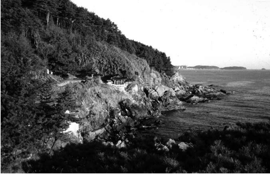
Cave of Avalokiteśvara at Naksan, Yangyang, Gangwon-do