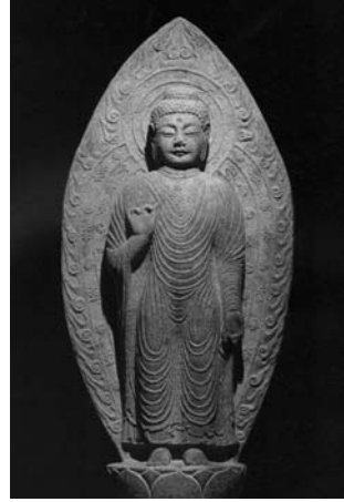
Standing Amitābha statue of Gamsansa, National Museum of Korea