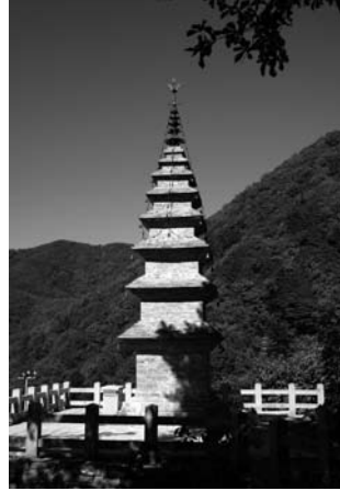
Sumano pagoda of Jeongamsa, Taebaeksan