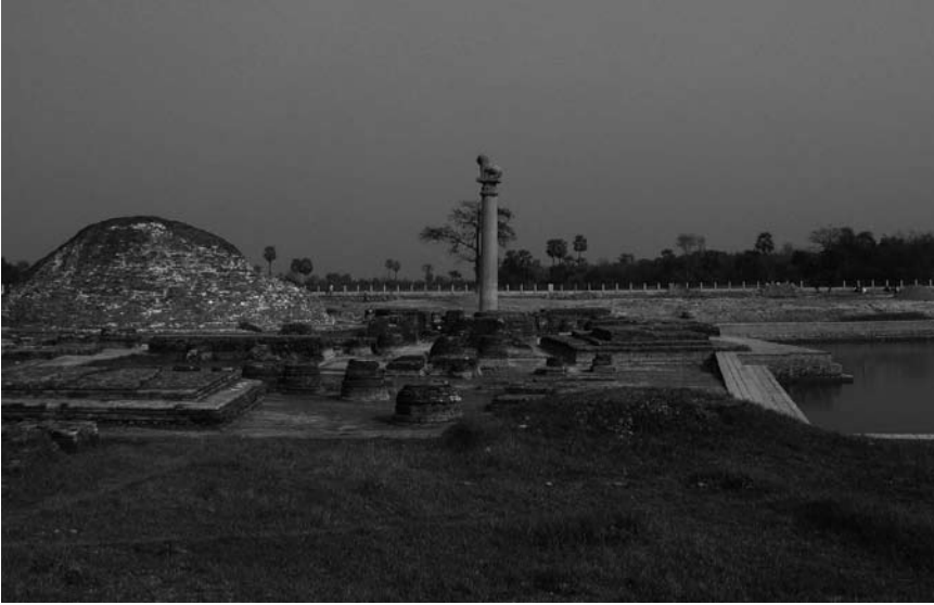
Great Stūpa of Vaisali, India

is in Kapilavastu, 66 the birthplace of the Buddha. The Asoka tree 67 can still be