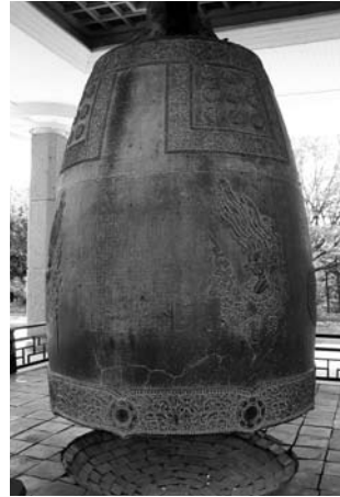
Great King Seongdeok's Divine Bell, Gyeongju National Museum

This chapter tells the story of Hwangnyongsa's great bell, Bunhwangsa's statue of Buddha Bhaiṣajyaguru and Bongdeoksa's bell, which together symbolized the golden age of Unified Silla's Buddhist culture in the mid-eighth century. It provides a record of the size in precise units of the Hwangnyongsa bell, which was four times larger than the still extant Bongdeoksa bell ( see illustration ), and also tells about King Gyeongdeok, who initiated its creation, the donors, and the artisans who made it. It also provides information about the scale of Bunhwangsa's statue of Buddha Bhaiṣajyaguru. King Gyeongdeok created the Hwangnyongsa bell and the Bunhwangsa statue of Bhaiṣajyaguru and began the manufacture of the Bongdeoksa bell for his father King Seongdeok but was unable to complete it. It was finally completed in accordance with his intention in the reign of King Hyeogong, who had it enshrined in Bongdeoksa, which was built for King Seongdeok. King Gyeongdeok, aware of the instability of royal authority in the mid-Silla period, pushed forward a restructuring of the administration and a policy of reform, and the creation of these artifacts was in line with his policy as they had a symbolic significance that enhanced the dignity of the monarchy. This record also shows that the three monasteries which held these artifacts were the central monasteries of Buddhism, which was considered of great importance to the ruling house at that time. As can