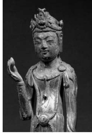
Avalokiteśvara statue, National Museum of Korea

Belief in Avalokiteśvara is one of the most universally held faiths as it is a belief in the bestowal of salvation in one's lifetime from the sufferings and cravings of this worldly existence. Therefore, in order to match the title "Three Places with Images of the Bodhisattva Avalokiteśvara," the three monasteries with Avalokiteśvara images should be treated as