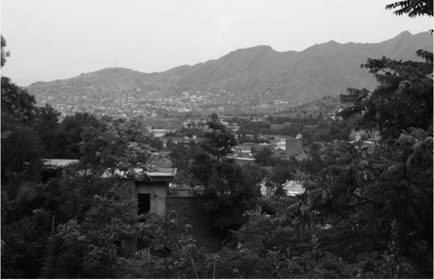
Panoramic view of Swat, Pakistan

又從此建馱羅國，正北入山三日程，至烏長國，彼自云鬱地引那。此王大敬三寶，百姓村庄多分，施入寺家供養，少分自留，以供養衣食。設齋供養，每日是常。足寺足僧，僧稍多於俗人也。專行大乘法也。衣着飲食人風，與建馱羅國相似，言音不同。土地足駝驛羊馬氈布之類。節氣甚冷。