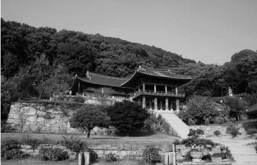
Buseoksa, Yeongju, Gyeongsangbukdo

managed to evade [execution] and returned ( these events are in the main biography by Duke Choe , 223 and also in Wonhyo's Account of Conduct ). 224