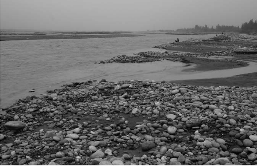
View of Khotan, China

又安西南去于闐國二千里，亦足漢軍馬領押。足寺足僧，行大乘法。不食肉也。從此已東，並是大唐境界。諸人共知，不言可悉。