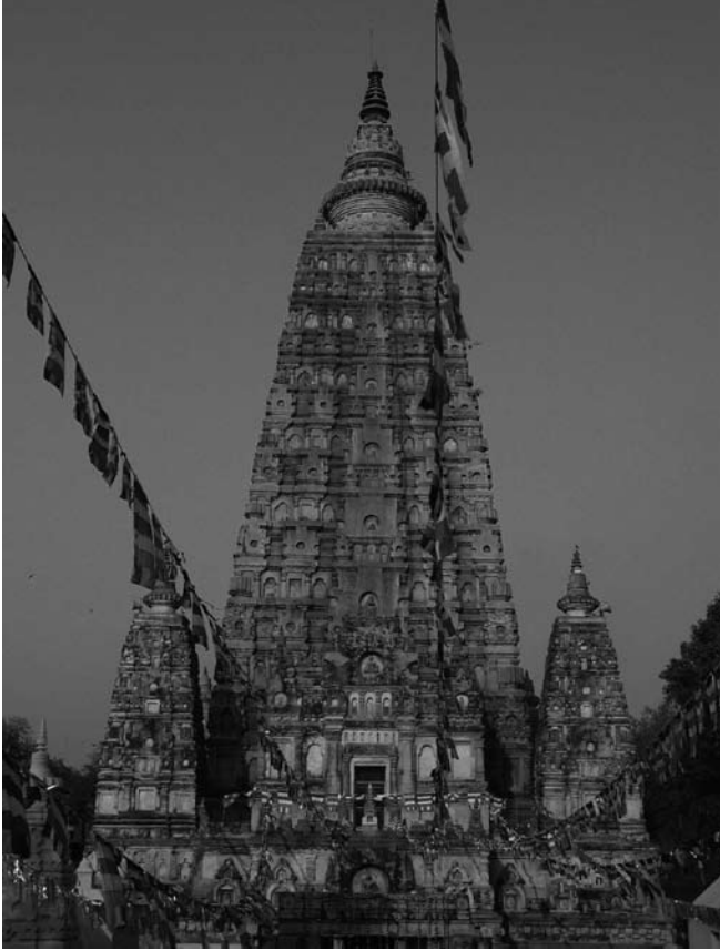
Mahabodhi Temple, Bodhgaya, India

briefly capture my foolish wishes in a five-character poem: