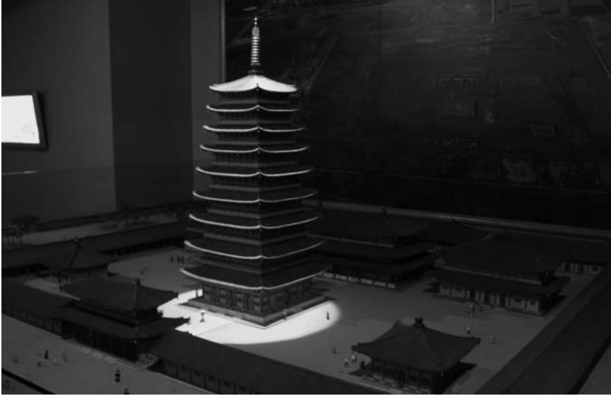
Model reconstruction of Hwangnyongsa, Gyeongju, Gyeongsangbuk-do

relating to the construction of the Hwangnyongsa pagoda and explains what changes occurred in the period after the construction of Hwangnyong Monastery up until the Goryeo dynasty, focusing on the damage caused by lightning strikes and subsequent repairs, and concluding with its destruction by fire during one of the Mongol invasions. It is a story that tells of the protection given to Silla by such immense artifacts as this statue and pagoda, which were both invested with the power of the Buddha, had deeply meaningful origins, and were built through the efforts of the nation.