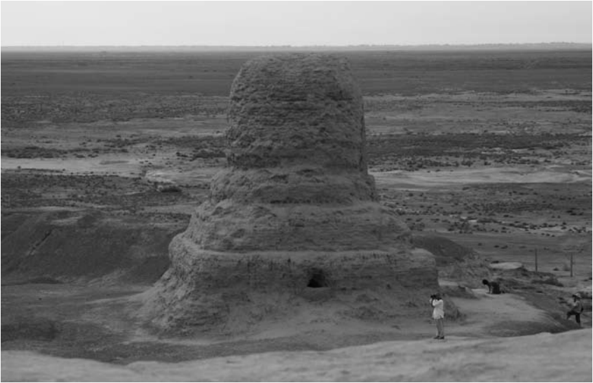
Mor Stūpa, Kashgar, China

又從蔥嶺步入一月，至踈勒。外國自呼名伽師祇離國。此亦漢軍馬守捉。有寺有僧，行小乘法。喫肉及葱韭等。土人着疊布衣也。