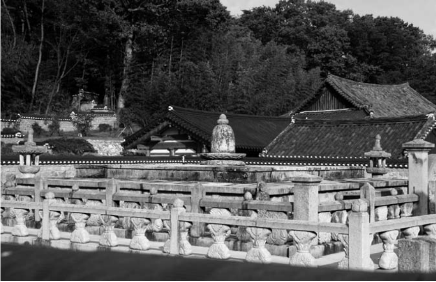
Ordination platform at Tongdosa, Yangsan, Gyeongsangnam-do

one of Buddha's teeth that had been set adrift on the sea in Song China was rescued and brought back to Goryeo where it was also housed in a shrine constructed inside the palace. At the time of the Mongol invasions when Gojong moved the court to Ganghwa Island this tooth was left behind. The officials responsible for it were examined, and when it was recovered, after its multi-layered container was checked, a shrine was built and it was placed inside. This account also reveals that the record of these events came from the monk Gagyū who was offering prayers in the palace at that time. This section also records the facts pertaining to the transmission of Buddhist sūtras to Silla and Goryeo, beginning with Liu Si and Mingguan at the time of King Jinheung and continuing with Jajang at the time of Queen Seondeok, Gudak at the time of King Heungdeok, Wonheung at the time of King Munseong, Boyo at the end of Silla, Mukhwasang at the time of Goryeo's Taejo, Hyejo at the time of Yejong, and National Preceptor Daegak at the time of Seonjong. Various records were used as source material including the Samguk sagi and other records, including old documents ( gogi ), a poem by Hyesim, the records left by monks who were directly involved in the events described, and a poem by Paeng Jojeok. In the last part of this