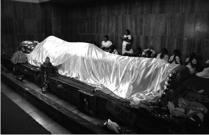
Reclining Buddha of Parinirvana Temple, Kushinagar, India

the eighth lunar month, 9 monks, nuns, laywomen, and laymen gather here and present a grand offering. On that [day] 10 countless flags appear in the sky around the stūpa. As a host of people see them, there are many who commit themselves to the dharma. There is a river to the west of the stūpa