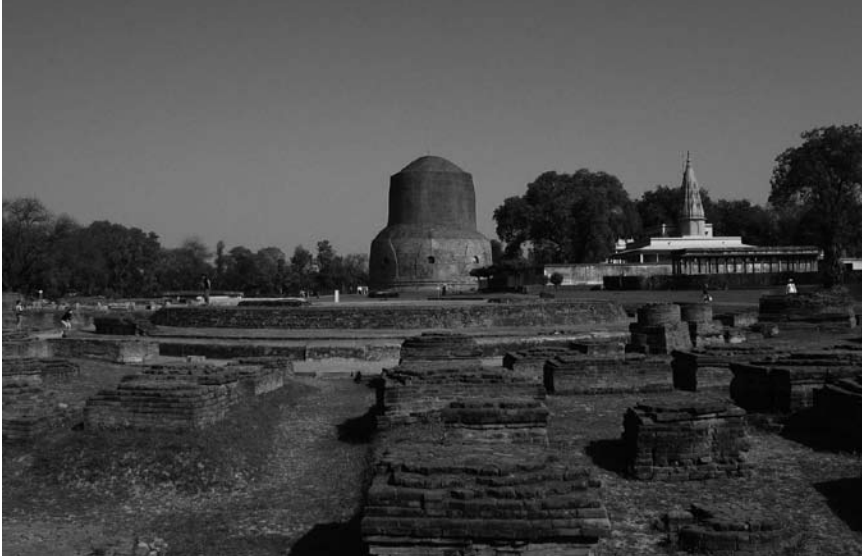
Deer Park at Sarnath near Varanasi, India

named Śīlāditya. 25 A gilt-bronze [Dharma Wheel] 26 was also constructed here,