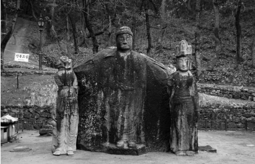
Buddhas of the Four Directions, Gulbalsa site, Gyeongju, Gyeongsangbuk-do

outstanding artifact, and this record accepts the account as being basically factual, as the same content is also found in various Chinese records such as Duyang zabian (杜陽雜編, a record of miscellaneous events between 763 and 873). The capacity to create a model of a concrete and precise realization of the Buddha Land clearly demonstrates the level of Silla's plastic arts at that time. According to the description, this large-scale model of Mt. Manbul was truly impressive, around one gil (one jang , i.e. ten feet) high and with bells that rang when the wind blew. Through this record we can see that in the mid-eighth century at the time of King Gyeongdeok, a vigorous exchange of Buddhist culture was taking place between Silla and Tang. It also shows that in his reign, when artifacts representing the essence of Silla's plastic arts such as those at Bulguksa and Seokbalsa and the Bongdeoksa bell were created, this artistic capability became known and was highly praised in China.