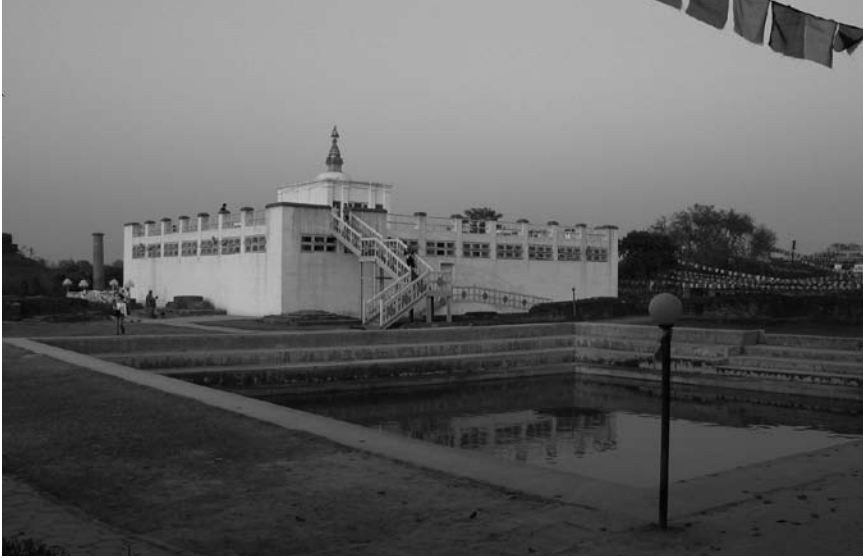
Mayadevi Temple, Lumbini, Nepal

seen, but whatever city once existed is now only in ruins. The stūpa is there, but there are neither monks nor villagers living nearby. The city is located