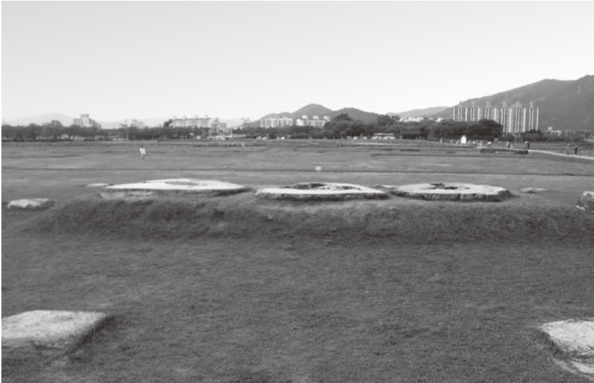
Site of Buddha triad at Hwangnyongsa, Gyeongju, Gyeongsangbuk-do