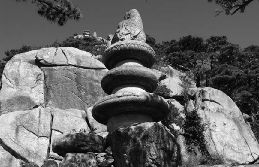
Yongjangsa on Namsan, Gyeongju

on Namsan. The temple had a sixteen-foot stone statue of Maitreya. [Dae]hyeon would frequently circumambulate it, and the statue also turned its face to follow him. [Dae]hyeon spoke with wisdom and clarity, and had a keen mind. He was decisive and clear [in arguments]. He completely mastered the doctrines of the [Beop]sang school, whose principles are very elusive and difficult to confirm or refute. The famous Chinese scholar Bai Juyi (772–846) once tried to penetrate them but failed to do so, and therefore declared “Mere ideation [Buddhism] 368 is abstruse and hard to break, even the application