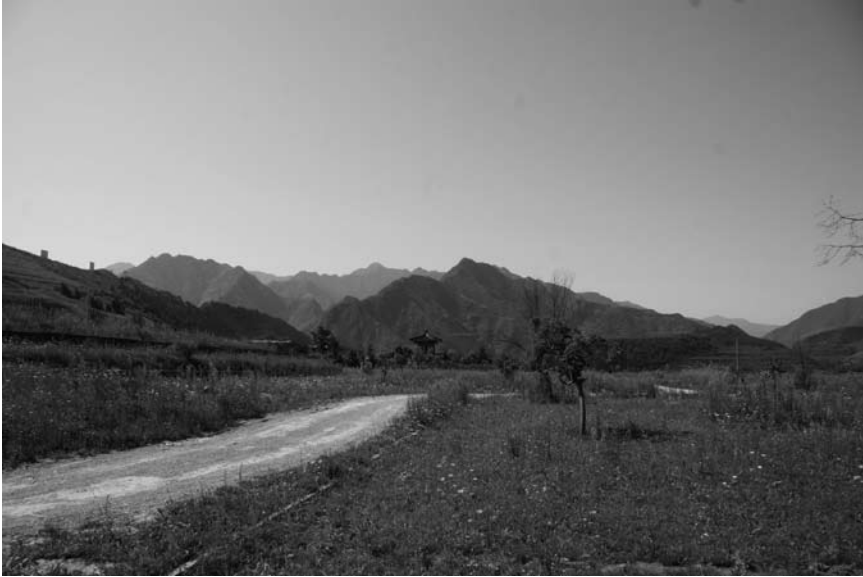
Site of Xianyouxi, Shaanxi sheng Zhouzhi xian, China

elder. Yet in regard to the patriarchal succession of the Esoteric school, he is said to have been Amoghavajra's disciple. Indeed, in his will Amoghavajra listed very clearly among his six outstanding disciples, "Silla Hyecho." 13