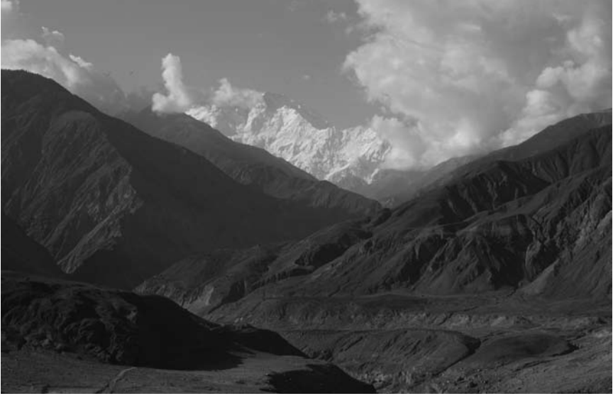
Pamir Plateau, China

又從胡蜜國東行十五日，過播蜜川，卽至蔥嶺鎮。此卽屬漢，兵馬見今鎮押。此卽舊日王裴星國境，爲王背叛，走投土蕃，然今國界，無有百姓。外國人呼云渴飯檀國，漢名蔥嶺。