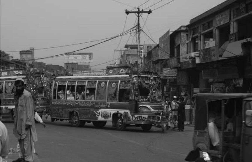
Street scene, Peshawar, Pakistan

king, 139 and at that time, the father 140 of the Turkic king arrived with a small