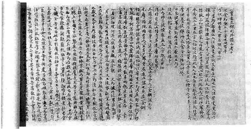
Manuscript of Wang o cheonchuk gukjeon