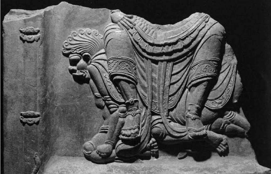
Statue of guardian deity found at the Sacheonwangsa temple site (Gyeongju National Museum)

cotton bag hung at the head of his monk's staff. 67 The staff could fly by itself to a donor's house, where it would shake and make a noise; the family then knew they had to contribute toward the expenses for rituals. When the bag was full, the staff flew back. Therefore his temple was called Seokjangsa, or Staff-temple. 68 The marvels that he produced were all as unfathomable as this.