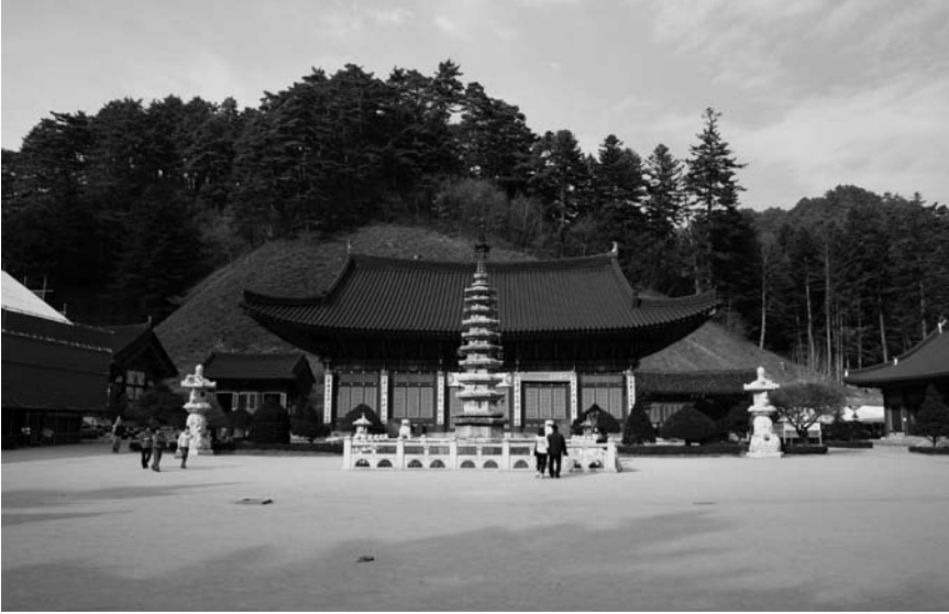
Woljeongsa on Mt. Odae, Pyeongchang, Gangwon-do

the princes were worshipping Buddha and these bodhisattvas every morning, the bodhisattva Mañjuśrī appeared in 36 different forms, and the two princes made offerings of tea and dedicated themselves to their Buddhist practice. When the nation's sovereign was deposed, and the people came to entreat the two princes to return to the palace, Bocheon declined, and Hyomyeong ascended the throne. In 705 Hyomyeong founded Jinyeo Monastery (Jinyeowon) and inaugurated the Flower Adornment Society (Hwaeomsa). The monastery was paid for by the nearby villages, and he also established a farm for its upkeep. Bocheon on the other hand continued to practice his devotions for fifty years and experienced many miracles such as divine beings coming down from heaven to listen to his sermons and to offer him tea. The bodhisattva Mañjuśrī also gave him a prognostication of his future enlightenment.