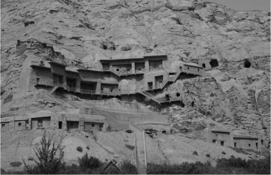
Caves, Kizil, China

又從踈勒東行一月，至龜茲國。卽是安西大都護府，漢國兵馬大都集處。此龜茲國，足寺足僧，行小乘法。食肉及蔥韭等也。漢僧行大乘法。