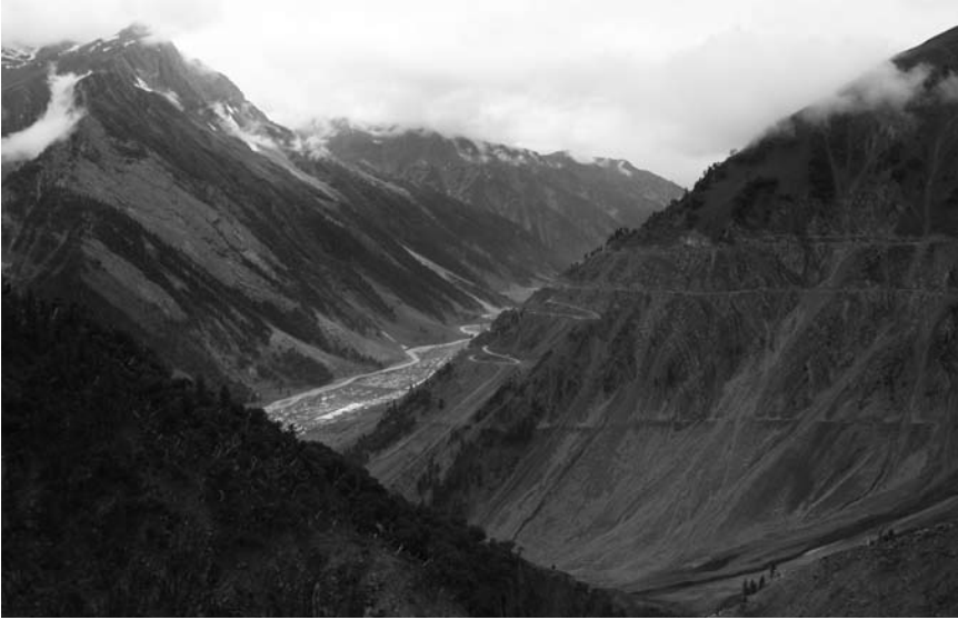
Road to Kashmir from Srinagar, India

places I have spoken about up to now. There is frost in autumn, and snow in winter; monsoon rains in the summer bring with them the blooming of all sorts of plants and their verdant leaves, which then die and scatter in fall. The valleys and streams here are narrow. From south to north, the valley is only a five-day walk, and from east to west, only a single day's journey. 116 The [arable] land is very restricted; the rest is comprised of densely packed mountains.