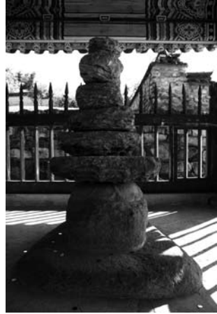
Pasa Stone Pagoda, Gimhae, Gyeongsangnam-do

This chapter concerns a stone pagoda in the capital of ancient Geumgwan Gaya, located in the Gimhae region. This stone pagoda, part of which still remains today, is made from a type of stone that is not found in Korea, and because of its unusual shape the opinion that it was made in another country has persisted. This chapter records that the pagoda was transported from the Indian kingdom of Ayodhyā by Princess Heo Hwangok, the consort of Gaya's first sovereign King Suro, when she came to Gaya in AD 42. This theory of the transmission of Southern Buddhism (Theravada) to Gaya is controversial, and the pagoda's shape differs from that of Indian stūpas. Therefore, Iryeon himself does not acknowledge the introduction of Buddhism at this time and he adds that the monastery was built in 452. Nevertheless, in relation to this, he also introduces the anecdotes and historical remains connected with Heo Hwangok's arrival in Gaya. This suggests that Iryeon, while understanding Buddhism as being centered on the Three Kingdoms, considered that it was also transmitted to Gaya at this time.