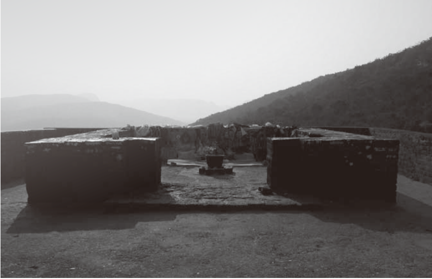
Vulture Peak, Rājagṛha, India

[ text missing ] statues. These images were made by a former king of Magadha 24