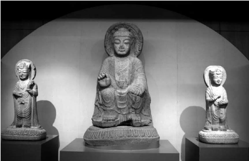
Maitreya Buddha Triad of Mt. Namsan, Gyeongju National Museum

thought to reveal features of Maitreya beliefs that were in general circulation until Goryeo times. The quoted sources are explained and compared with the History of the Three Kingdoms ( Samguk sagi ) without being presented separately.