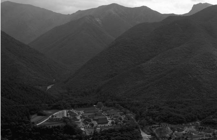
Panoramic view of Unmunsa, Cheongdo, Gyeongsangbukdo

589); his assistance in the ideological training of people through the “five secular precepts” upon his return; his convening of a Hundred-seat assembly for a Chinese envoy in 613; and his writing of diplomatic correspondence asking for military assistance. Furthermore, we also know that he was associated with a temple on Gaseo peak close to what is now Unmunsa in Cheongdo, and that he introduced the latest texts and practices from China, such as the newly translated Mahāyānasamgraha śāstra , the Zhancha jing , and its divination practices.