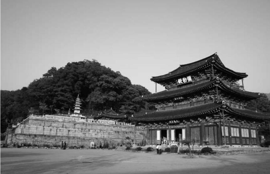
Geumsansa, Gimje, Jeollabukdo

referred to in the notes. There is also a biography of Jinpyo in fascicle 14 of Zanning's Song gaoseng zhuan , which contains detailed information about Jinpyo's motivation for becoming a monk and about the confessional rite using the two divination strips.