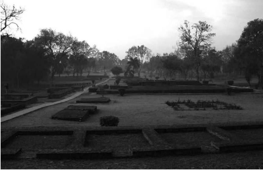
Jetavana, Sravasti, India

the stūpa is present, the temple is in ruins and there are no monks. The third